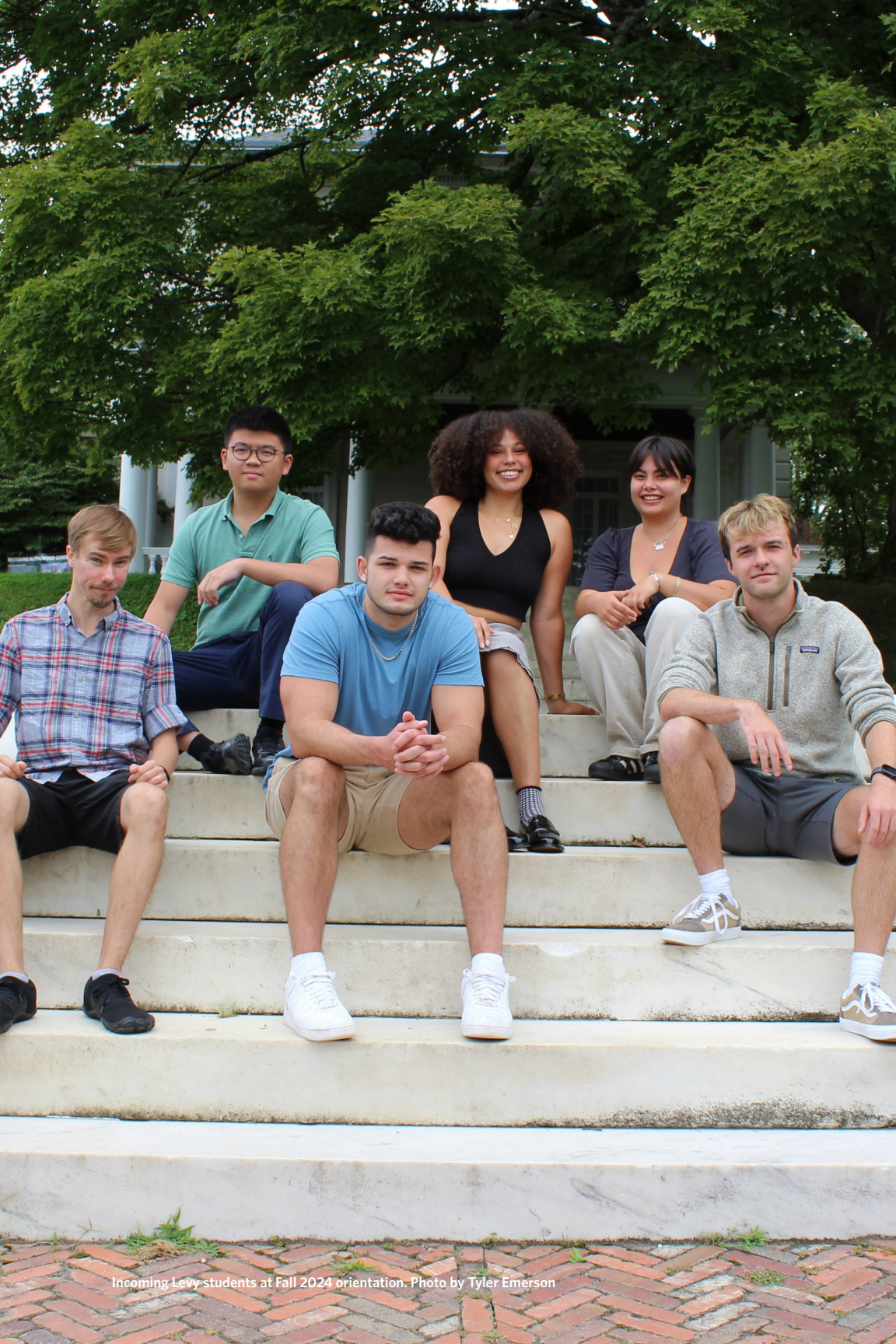
Incoming Levy students at Fall 2024 orientation.

We are excited to launch a series of new scholarships and research assistantships to students showing academic promise and interest in incorporating gender, government finance, institutional theory, and labor issues into study of the macroeconomy. These are in addition to our named scholarships for the study of financial instability and macromodeling. For more, see p. 12.