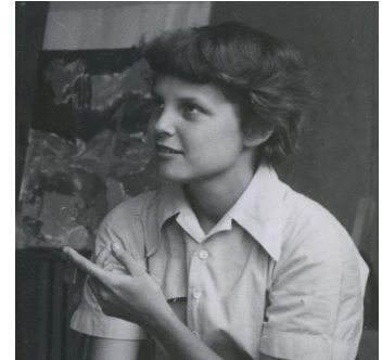
Fitzhugh at Bard ca. 1948

Fitzhugh was not only the author of the Harriet trilogy (which includes The Longest Secret and Sport ) but also of the lesser known Nobody's Family is Going to Change , the controversial Bang Bang You're Dead , The Wonderful Adventures of Suzuki Beane , Lovable Little Hipster , and the posthumously published I am Three, I am Four, and I am Five .