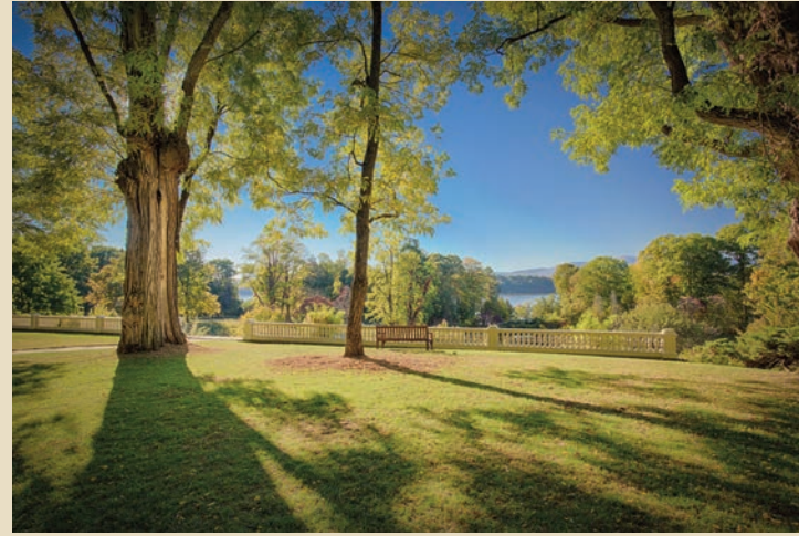
Westward view of the grounds

In 1839, Louise and Cora commissioned architect Frederick Catherwood to design an opulent wood-and-glass conservatory. Andrew Jackson Downing designed formal garden beds and manicured paths to surround the gothic revival-style conservatory, framed by a forest to the north and an allée of locust trees to the south. From its construction in 1840 until its destruction circa 1880, the conservatory was the most commanding structure on the Montgomery Place landscape aside from the mansion. In 1935, Violetta Delafield designed the first "wayside stand" for a garden club display and as a way to encourage local farmers to sell their produce and make roadsides more attractive. Eventually, it became a farm stand which still exists, selling the estate's apples and other fruit.