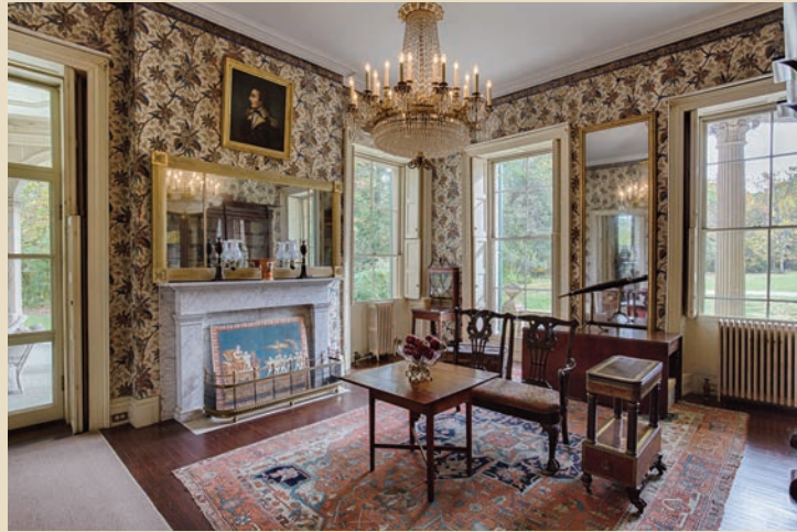
The mansion house's Montgomery Room