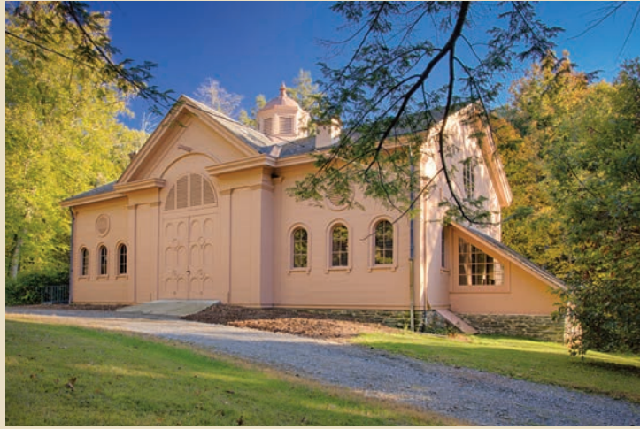
The Coach House