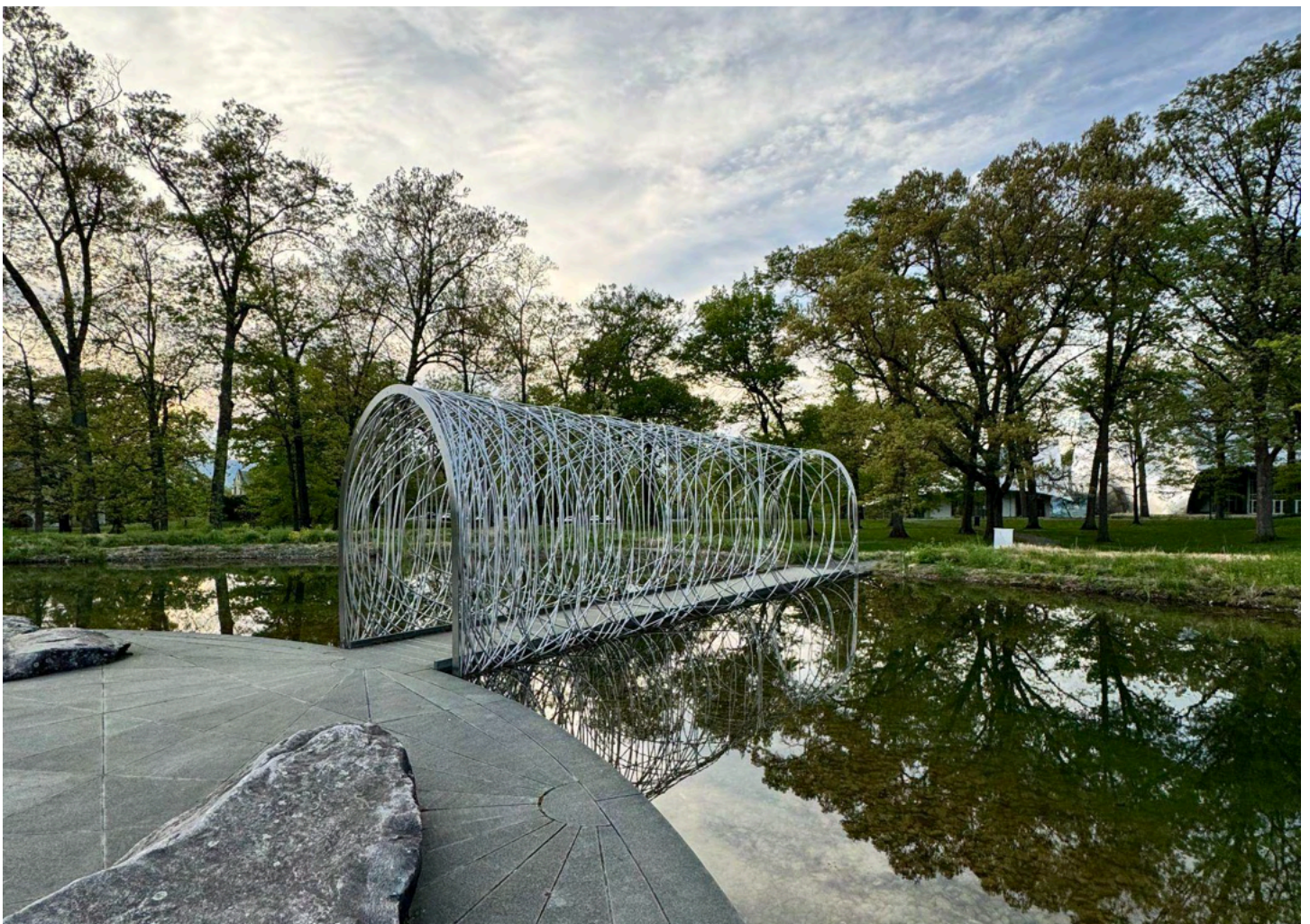
The Parliament of Reality

Containing Statistics for 2021, 2022, and 2023