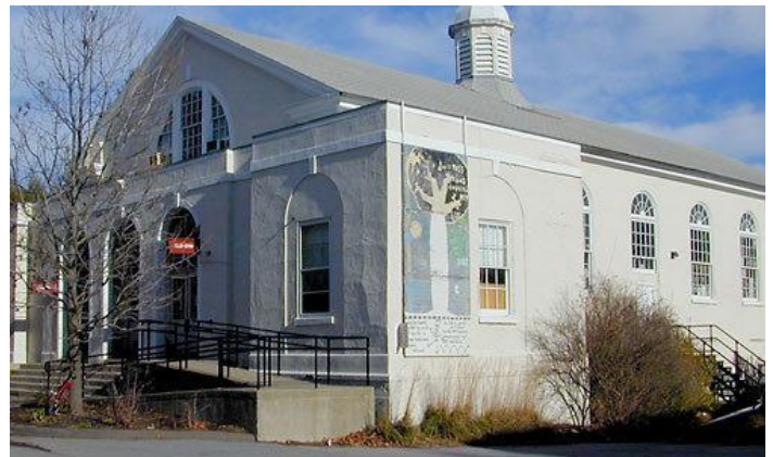
The Office of Safety and Security in The Old Gym

Each residence hall is equipped with a campus telephone located near its main entrance. In addition, Bard has emergency phones located at key points on campus. These hands-free phones offer a direct line to the Office of Safety and Security. One can also report incidents to the Office of Safety and Security in person at the Old Gym, located adjacent to the Olin Humanities Building and South Hall.